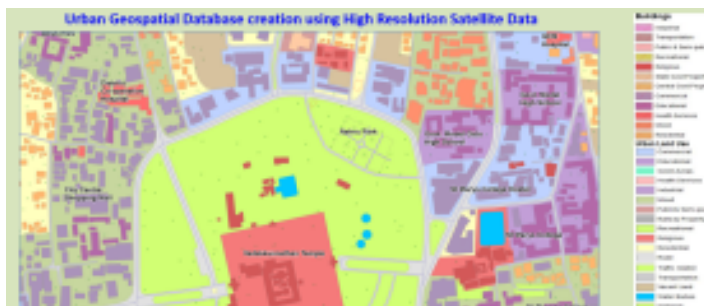
Large Scale Map of part of Thrissur, Kerala

Large Scale Maps (LSMs) generated using high resolution satellite/ aerial remote sensing images are extensively used for micro-level planning such as preparation of base maps for urban infrastructure, AM & FM Applications and panchayat level development plans and services. LSM maps in the scale of 1: 500 to 1:10,000 are generated through ortho-rectification for geometric fidelity and planimetric accuracy. Depending on nature of application, detailed topological data, together with the associated thematic layers and attribute information are generated using different geospatial techniques like photogrammetry, GPS, GIS and Mobile Applications.