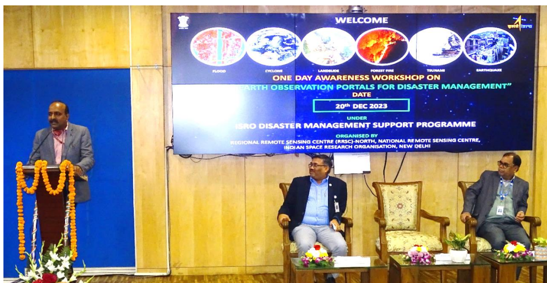
Address by the Chief Guest during the Inauguration of the Workshop