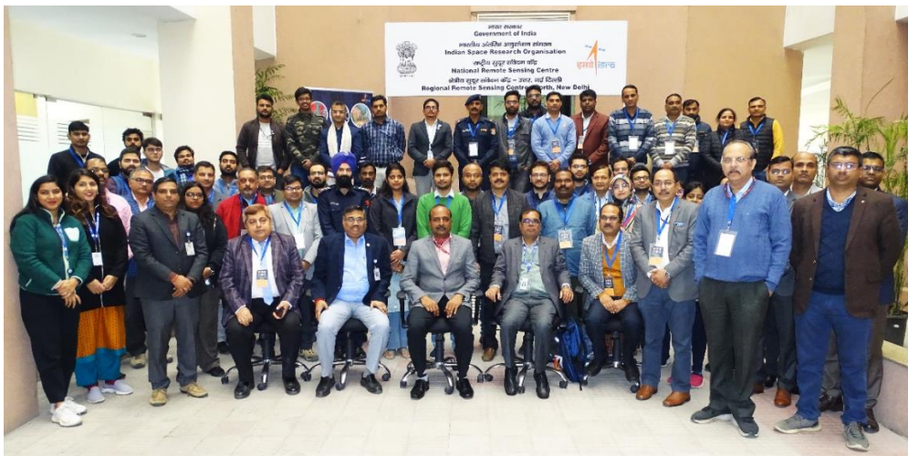
Participants of One-Day Awareness Workshop on 'Indian Earth Observation Portals for Disaster Management'

The workshop attracted 49 participants from 17 diverse organizations and departments . The participants of the workshop included nominated representatives from various Central and State Government Agencies, National Disaster Response Force, State Remote Sensing Centres, World Health Organisation, Academic Institutions and Research Organisations. Four lectures focused on showcasing MOSDAC & VEDAS Services, NDEM Services for Disaster Management, Data Download and Visualization through NRSC's Bhoonidhi Portal and Bhuvan Services for Disaster Management were delivered.