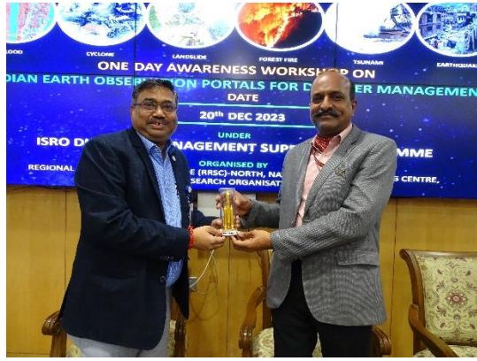
Felicitation of Chief Guest after the inaugural address

The workshop attracted 49 participants from 17 diverse organizations and departments . The participants of the workshop included nominated representatives from various Central and State Government Agencies, National Disaster Response Force, State Remote Sensing Centres, World Health Organisation, Academic Institutions and Research Organisations. Four lectures focused on showcasing MOSDAC & VEDAS Services, NDEM Services for Disaster Management, Data Download and Visualization through NRSC's Bhoonidhi Portal and Bhuvan Services for Disaster Management were delivered.