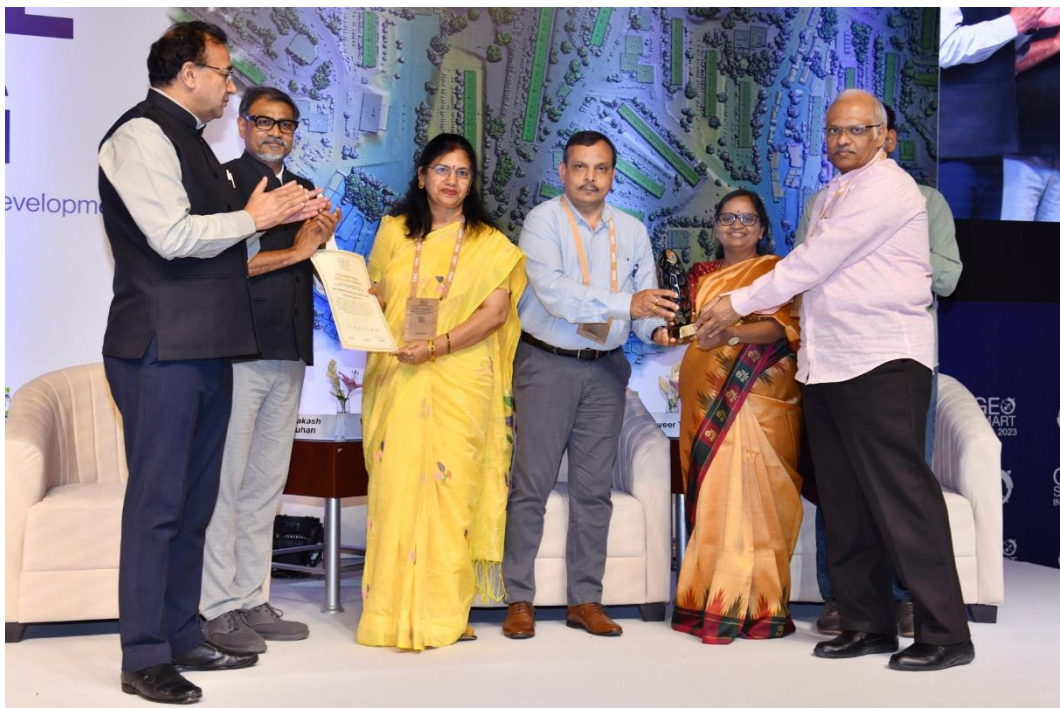
Geospatial Excellence Award Ceremony at HICC, Hyderabad on 19 October, 2023

NDEM has undergone several progressive changes and the latest version of NDEM version 4.1 has been designed and developed and released by Honorable Union Minister of State, Ministry of Home Affairs during 3 rd NPDRR, Delhi, 11 th March, 2023. For the continuous support of NDEM in Disaster Risk Management in the country, NDEM has received Geospatial Excellence Award 2023 during GeoSmart Conference on 19 October, 2023 at Hyderabad.